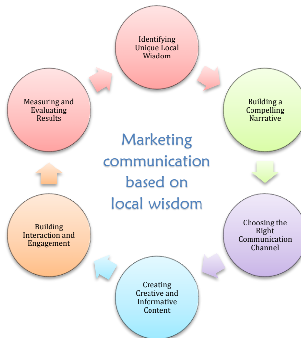
Figure 2. Marketing Communication Model Rooted in Local Wisdom

The Tomalou Fishing Village Festival stands out as an exemplary showcase of how local wisdom can be optimally utilized to attract tourists through the implementation of effective marketing communication strategies. In this endeavor, several aspects need to be considered within the scope of marketing communication, including identifying the uniqueness of local wisdom, crafting compelling narratives, selecting appropriate communication channels, creating creative and informative content, fostering interaction and engagement, as well as measuring and evaluating outcomes as illustrated in the following model: